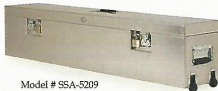
Model # SSA-5209