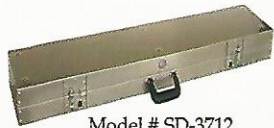
Model # SD-3712