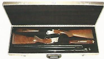
Model # SP-3712